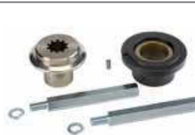
Grooved joint kit not to be used with 390035 (until sold out)