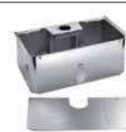
Stainless steel carrier case