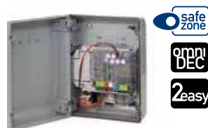
Control unit E024S Technical specifications page 147