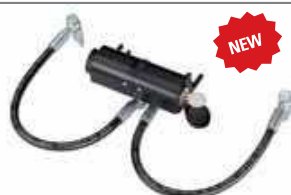
NEW** Hydraulic release system (to be used with 390972) for CBAC or SBW operators