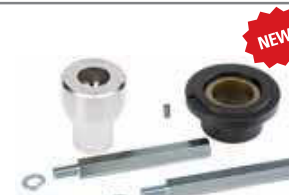
NEW Grooved joint kit (*) (to be used with code 390035)