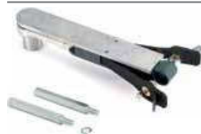
Lever release system for CBAC or SBW operators*